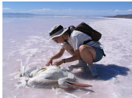
Removing ectoparasites from an American White Pelican on the flats of the Great Salt Lake, Utah.

Co-evolutionary ecology of hosts and parasites Biodiversity, biogeography, and systematics of parasites